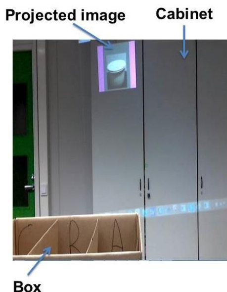
Figure 3. A scene from the laboratory during the task.

The task was to "Find and locate an object from the cabinet and put that object into the box behind." The idea behind this task was to engage each participant in a simple activity. Each participant followed the following step-by-step instructions given over headphones by a researcher located at the remote site a) Open the cabinet door b) Pick up the object from the shelf c) Close the cabinet door d) Put the object onto the correct location of the box (A, B, C). The box visible in figure 3, and each session was video recorded.