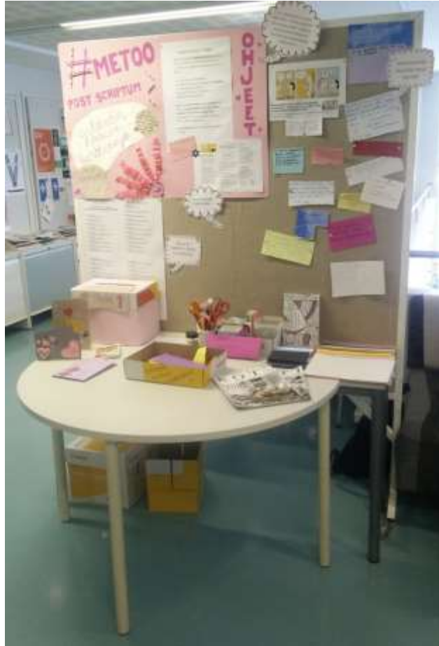
Figure 2. Pop-up stand in a university café. Picture from the research data.

In total, the research team collected and sent over 200 cards that were individually addressed to each member of the Finnish Parliament. A selection of the postscripts and cards was published on our campaign website (Huuki & Pihkala, 2018). A press release was put out just before Valentine’s Day, resulting in extensive coverage of the campaign in public and commercial media outlets. In the following weeks, Tuija also engaged in several interviews for radio, print media, and national television.