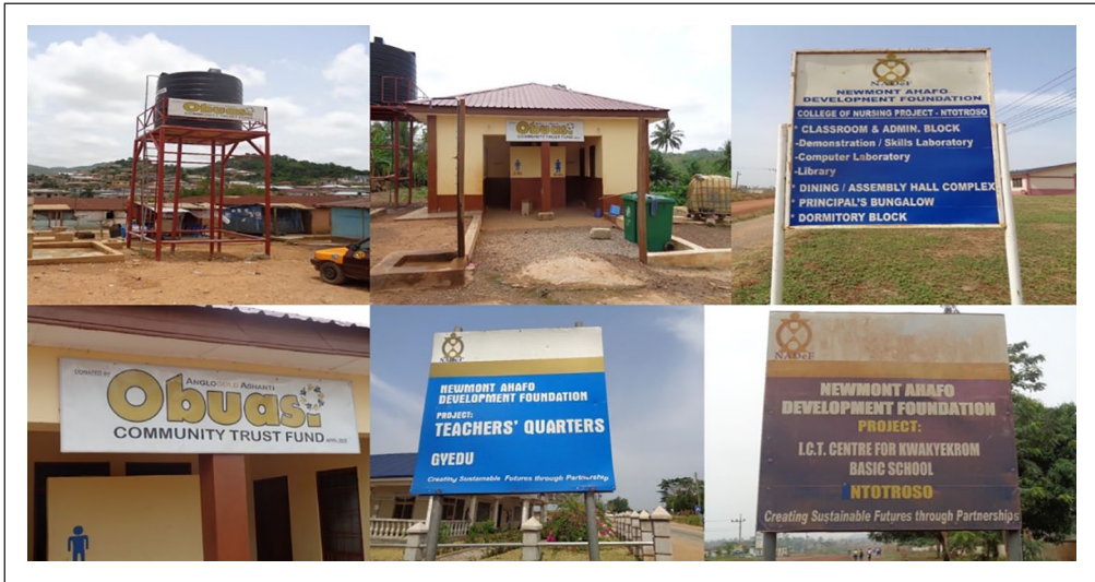
Figure 2. Programs and projects run by the Obuasi Community Trust Fund and NADeF (Photo by Kasimba in 2016).

grounds (Figure 2). Unfortunately, it was not possible to document the amount of funding spent on various projects and initiatives.