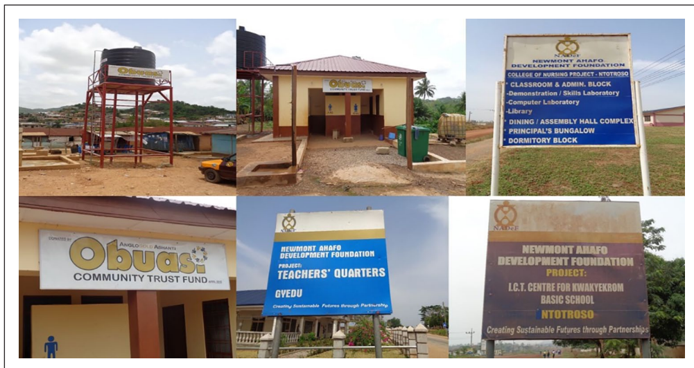
Figure 2. Programs and projects run by the Obuasi Community Trust Fund and NADeF.

grounds (Figure 2). Unfortunately, it was not possible to document the amount of funding spent on various projects and initiatives.